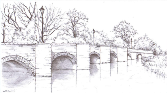
Nine Arches Bridge Thrapston