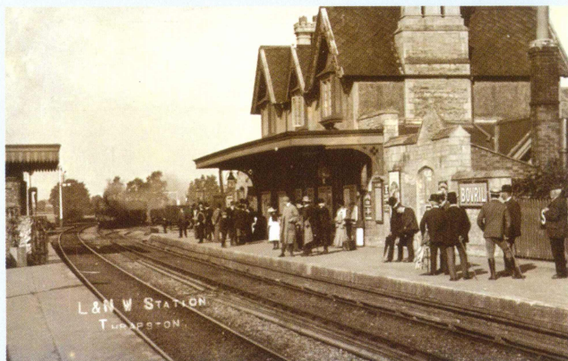
Bridge Street Station 1907

Other guides and reference books can be found in Thrapston Library.